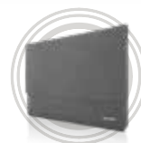
Lenovo Ultra Slim Sleeve