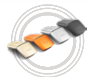
Lenovo Yoga Mouse