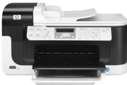
HP Officejet 6500 Series All-in-One