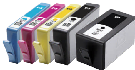
HP 920 Officejet Ink Cartridges: (Shown L to R) HP 920XL Cyan, Magenta, Yellow, HP 920 Black, HP 920XL Black