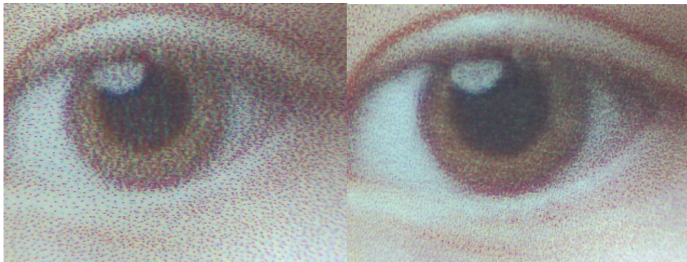
Micrograph of single-drop-volume image Micrograph of dual-drop-volume image