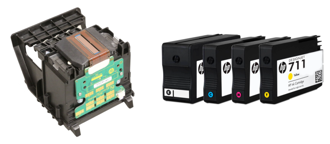
HP 711 Printhead and HP 711 Ink Cartridges

The HP 711 Printhead is part of a module that integrates the four-color HP Thermal Inkjet printhead with ink delivery systems for the four inks. A key design feature is that HP 711 Ink Cartridges are mounted on the printhead carriage and scan with it across the paper.