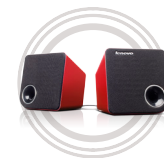
Lenovo™ M0620 2.0 USB Speaker