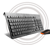
Lenovo™ 500 Wireless Mouse and Keyboard Combo