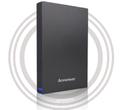
Lenovo™ UHD F309 1 TB

* Example of Lenovo IdeaCentre AIO catalogue naming convention