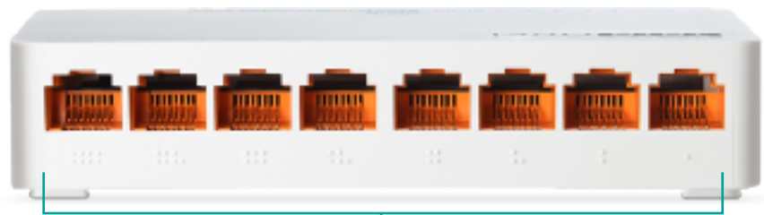
PC / Laptop