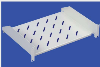
Cantilever shelf - I