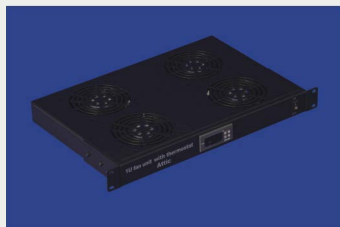
1U fan unit with thermostat